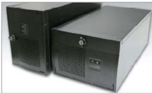
Horizontal or Vertical Mounting Options